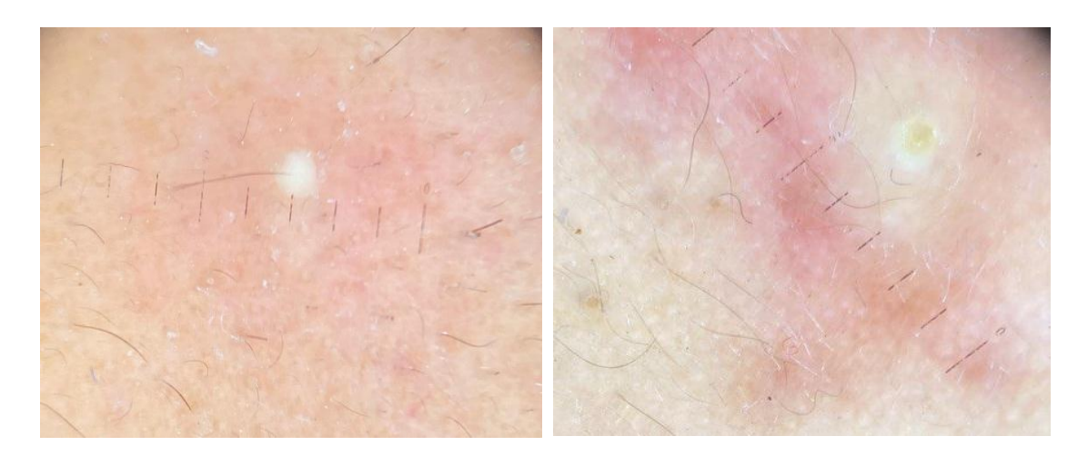
Fig. 1: Dermoscopic picture of closed comedone (A), open comedone (B)

On the other hand, pustules are characterized by a central white-yellowish area that represents the accumulation of purulent material within the lesion's cavity ( Fig.3 ).