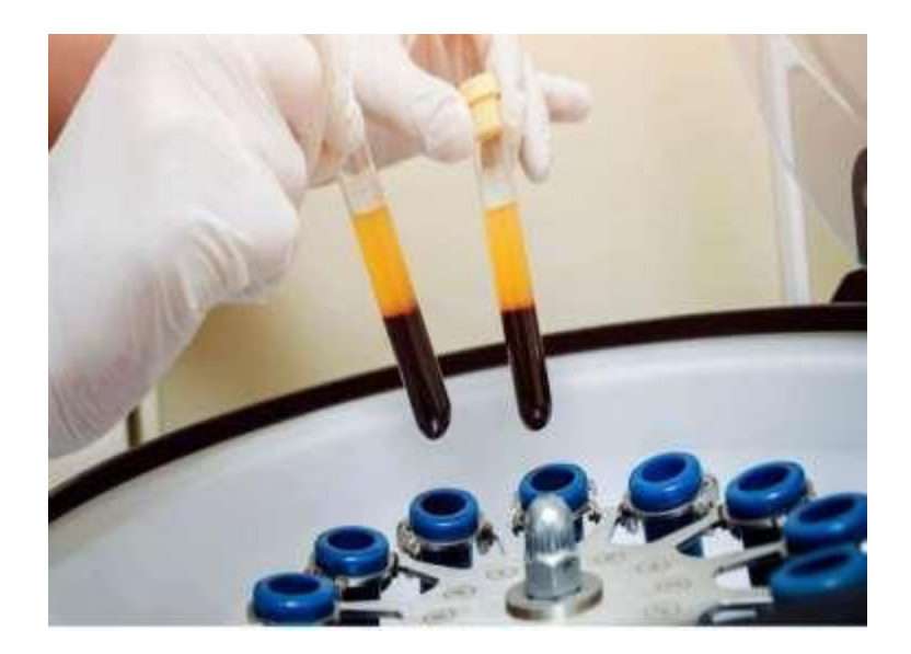
Figure (1): Centrifugation of whole blood with the supernatant (PRP)