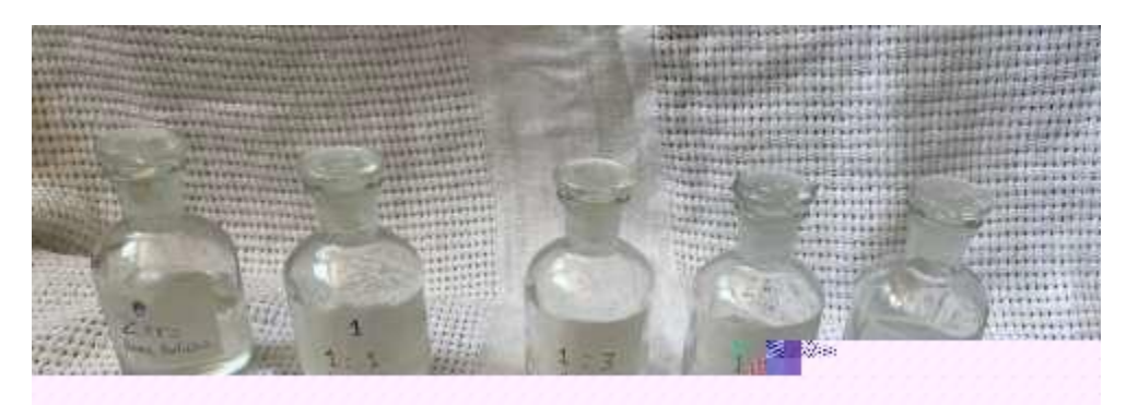
Figure (3): Bottles containing different concentrations of Butanol