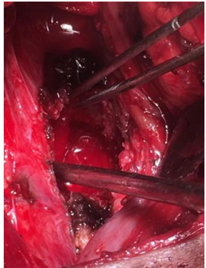
Fig. (5): Intraoperative Image