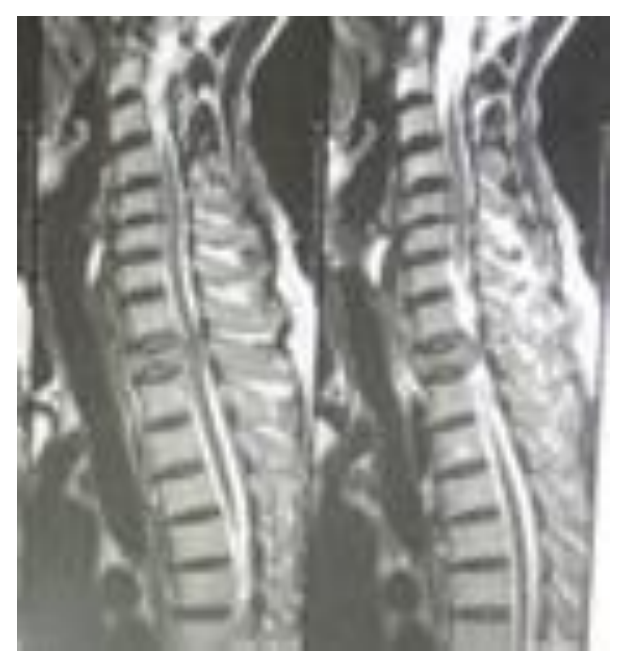
Fig. (2): T2 saggital image showing second thoracic vertebra pathological fracture

Fig. (1): STIR saggital image showing second thoracic vertebral pathological fracture