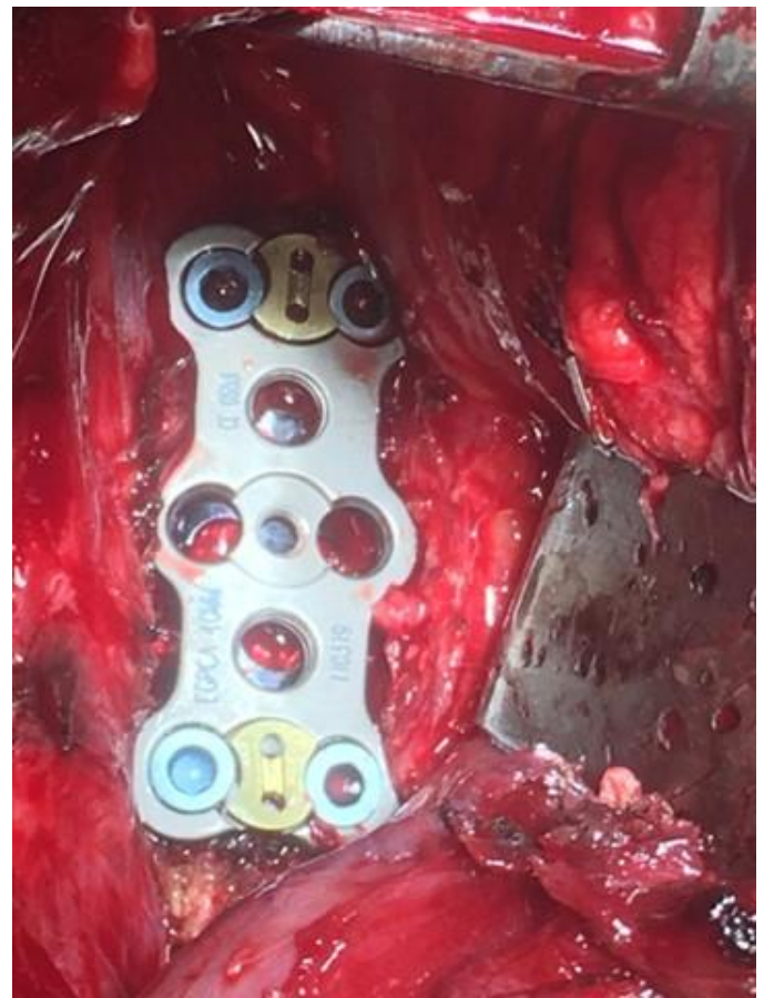
Fig. (7): Intraoperative Image Showing Plate And Pyra Mesh Fixation