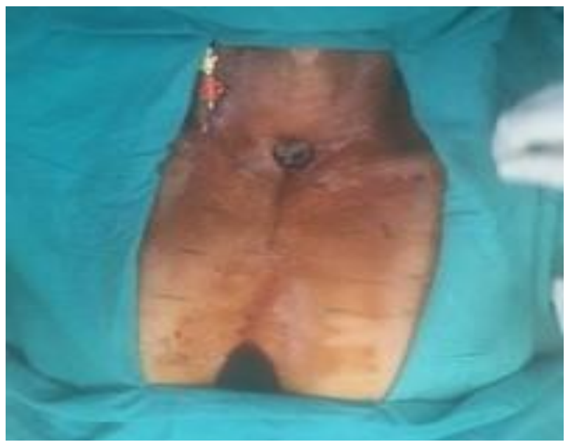
Fig. (4): preop preparation and planning of skin incision