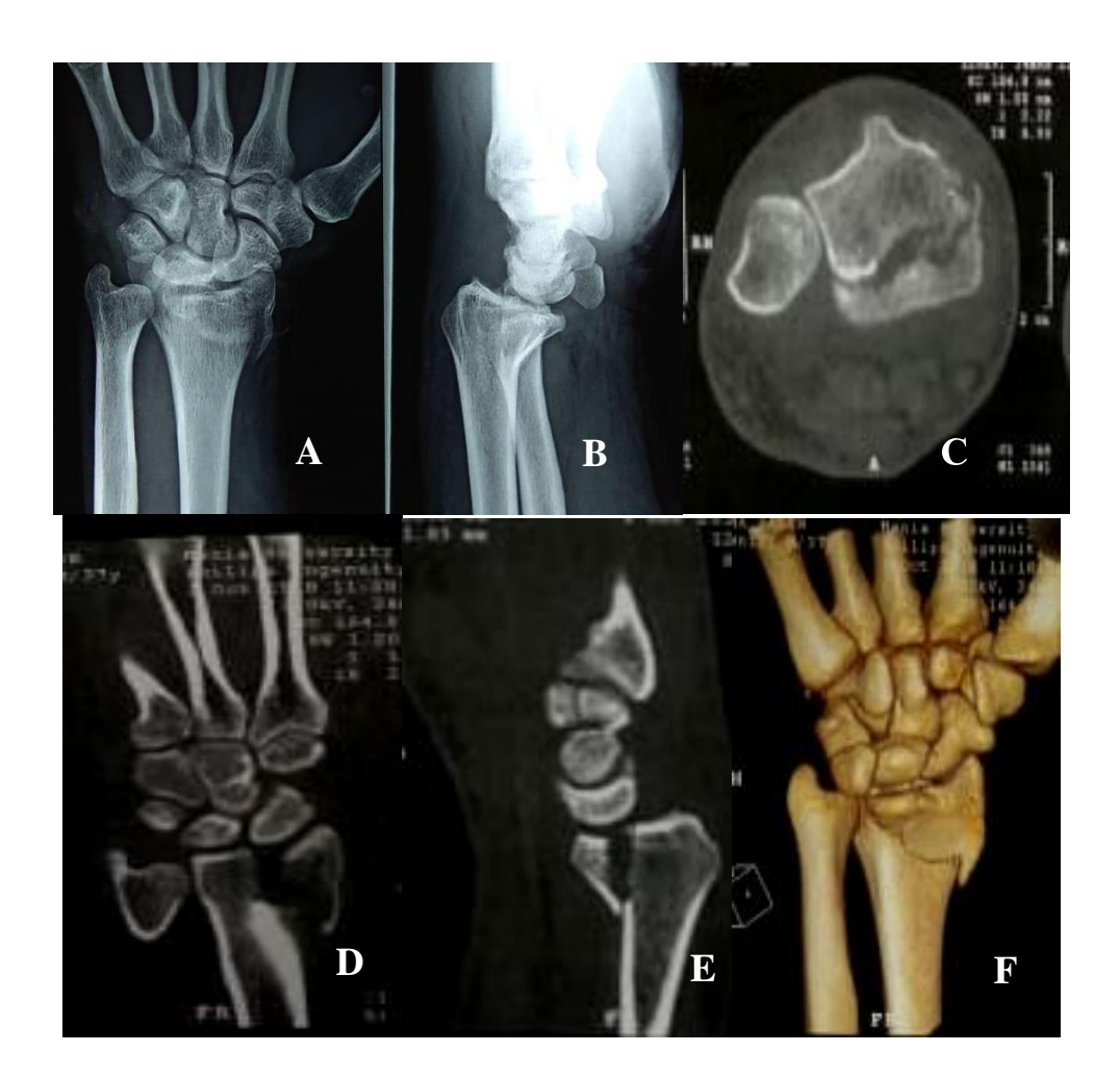
Figure 2: A&B: X RAY images show displaced fracture seen in right distal radius. C: axial image shows comminuted fracture with normal radioulnar joint. D: coronal image revealed the disruption of radiocarpal joint without interruption of radioulnar joint. E: sagittal image proves that the fracture extend to radiocarpal joint. F: 3D image revealed the real extension of the fracture.